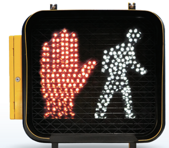
16" Pedestrian Housing